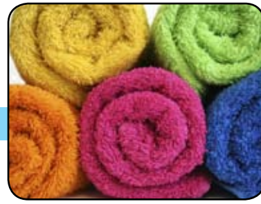
Better in the laundry.