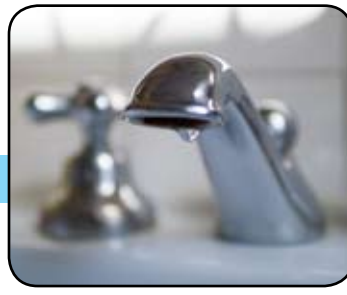
Better in the bathroom.