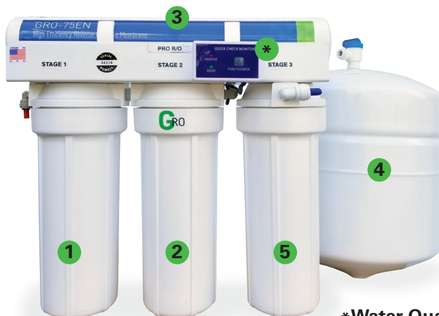
*Water Quality Monitor